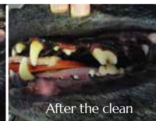
After the clean