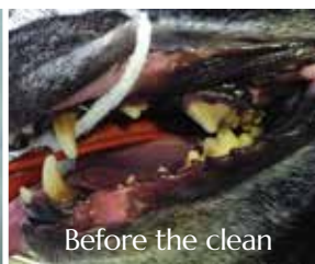
Before the clean